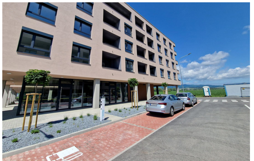
Chargers in Residence Hron