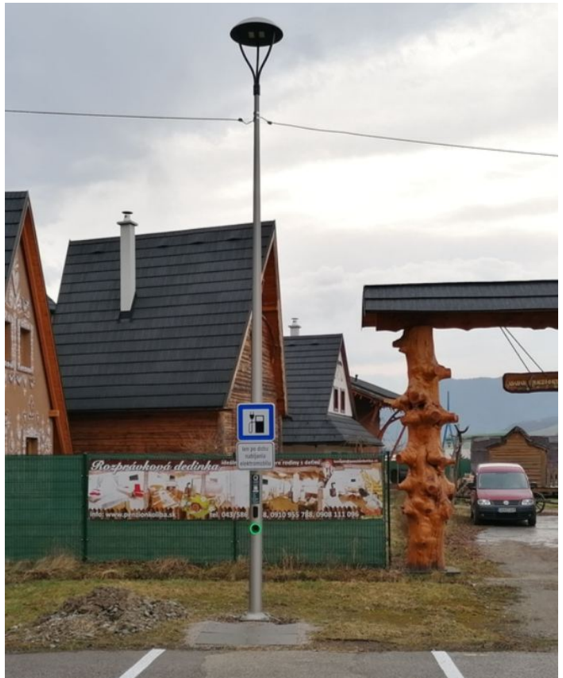
Charger in Koliba restaurant