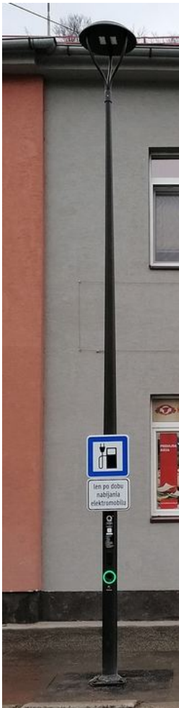
Charger integrated to lamp post